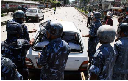
Police officers move damaged taxis.

Several of them were present at one such street-blocking protest outside the Pulchowk Engineering Campus, where a student was assaulted by a taxi driver. Within seconds, a mass of such drivers were hurling bottles and bricks into the campus. The students inside, who have been historically affiliated with non-Maoist political parties, if any, retaliated with an experienced ease. By the end of the hour-long showdown, five taxis were severely damaged though no injury was reported. “We have called for more party workers,” a YCL cadre had declared early on. “If you are not going to go in then let us go inside and take care of those students,” his colleague later yelled at a police officer trying to diffuse the situation. The police had convinced the students to stop pelting rocks by this time despite the initial obstinacy. The college was, in fact, distributing admission forms, so many would-be students were in the premises during the clash.