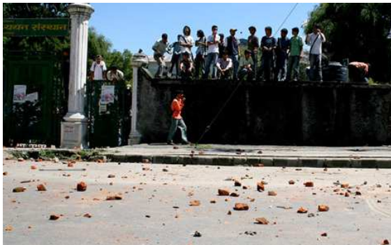
Students stay on guard, prepared to re-engage if needed

Several of them were present at one such street-blocking protest outside the Pulchowk Engineering Campus, where a student was assaulted by a taxi driver. Within seconds, a mass of such drivers were hurling bottles and bricks into the campus. The students inside, who have been historically affiliated with non-Maoist political parties, if any, retaliated with an experienced ease. By the end of the hour-long showdown, five taxis were severely damaged though no injury was reported. “We have called for more party workers,” a YCL cadre had declared early on. “If you are not going to go in then let us go inside and take care of those students,” his colleague later yelled at a police officer trying to diffuse the situation. The police had convinced the students to stop pelting rocks by this time despite the initial obstinacy. The college was, in fact, distributing admission forms, so many would-be students were in the premises during the clash.