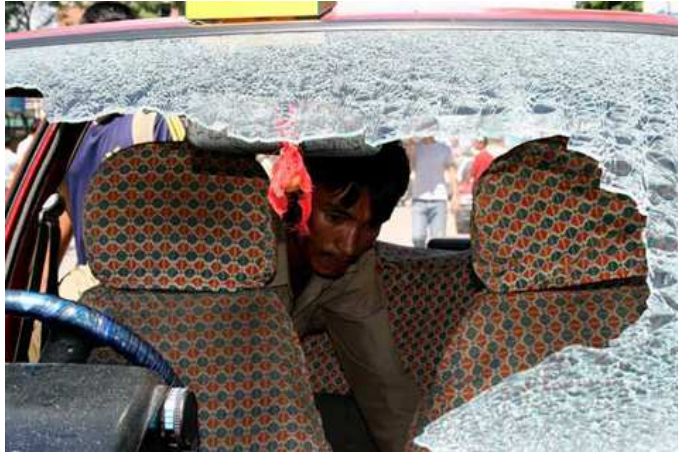
A driver checks a damaged taxi in Pulchowk.

September 21, 2007: Ramadan, one of the most important months in the Islamic calendar, is being observed between 13 September and 12 October this year. However, ethnic riots today have forced local authorities to temporarily evacuate the entire Muslim community of Tulsipur, Dang, and relocate them in nearby security forces' camps. The measure was taken after riots targeted at the community flared in this western district yesterday, when several Muslim-owned shops were looted and their homes vandalized. One was even burnt down, and was still smoldering late this evening.