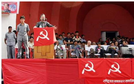
Maoist leader Baburam Bhattarai speaks at a mass meeting.

Today, Home Minister Krishna Sitalua has hinted that there are certain groups inciting the unrest for their vested interest. On the other hand, the CPN- Maoists, of which the YCL is a sister organization, has blamed the local authorities for letting the riots get out of hand and blamed “regressive” forces for the unrest.