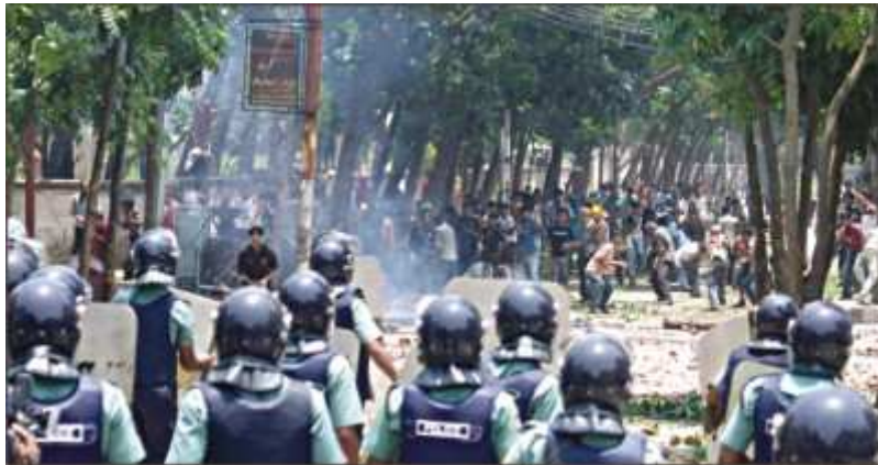
Unruly students of Dhaka Polytechnic Institute clash with law enforcers for the second consecutive day on campus yesterday.

At least 50 people were injured in clashes between students and police for the second day yesterday at Dhaka Polytechnic Institute over a student's death in road accident the night before.