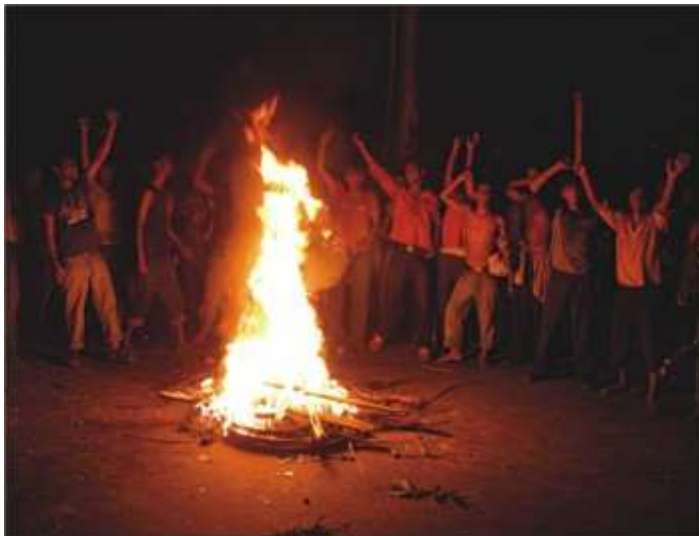
Polytechnic students stage protest blocking Tongi Diversion Road at Tejgaon Satrasta point for hours last night following death of a fellow student in a road accident.

Angry students of Dhaka Polytechnic Institute damaged at least 20 vehicles and set fire to a bus after a fellow student was killed in a road accident at Satrasta intersection on Tongi Diversion Road last night.